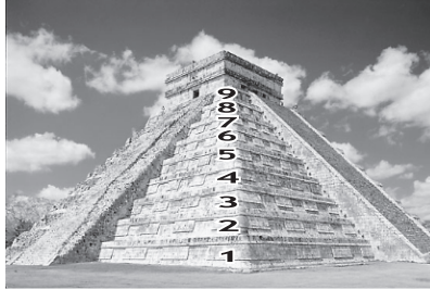
A Mayan pyramid depicting the 9 steps/Shifts in Consciousness

The first step represents the first Shift in Consciousness, which though primitive, forms the foundation for the second Shift in Consciousness. Each level builds on the previous one. As we go higher, each Shift takes less and less time. And after the ninth Shift, we reach the top of the pyramid, indicating that no more Shifts are required.